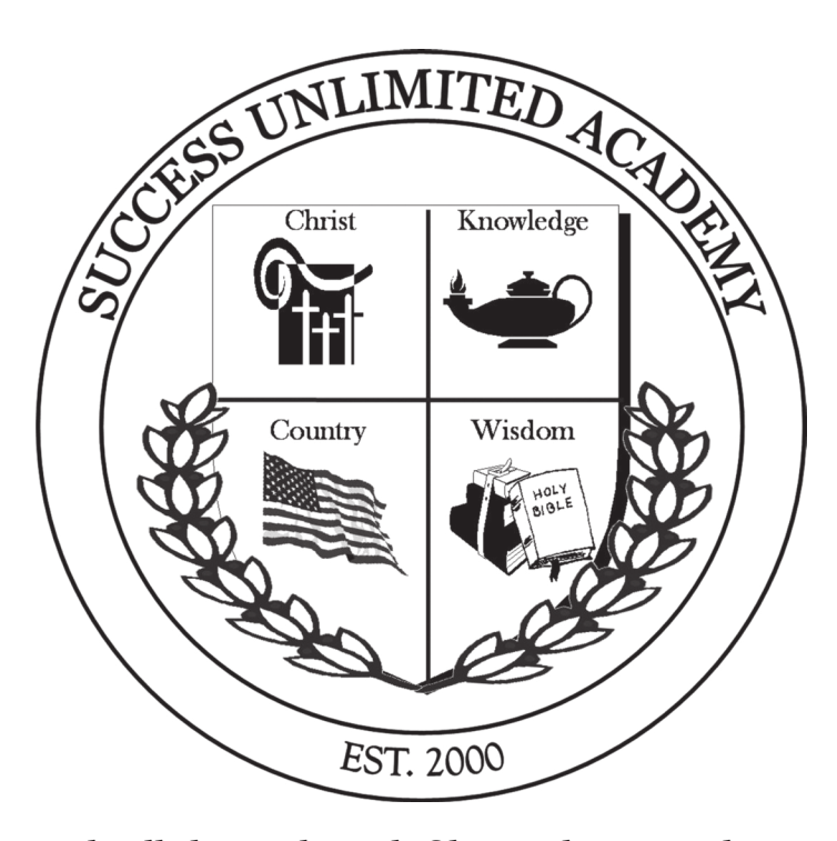
"I can do all things through Christ who strengthens me." Philippians 4:13